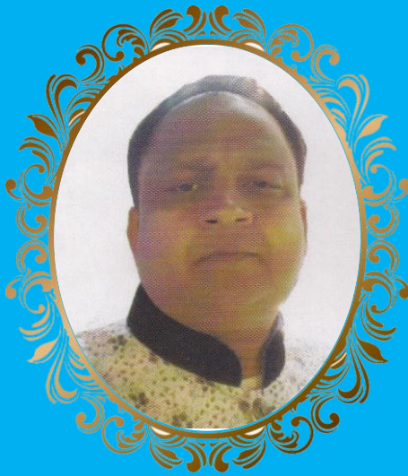
Shri Ajit Desai